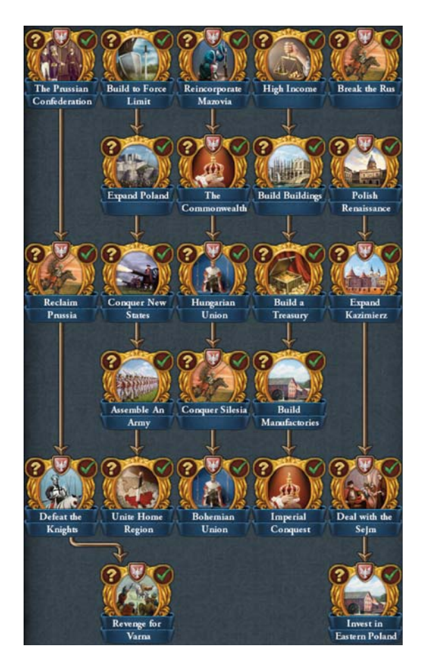
Figure 4. Polish mission tree

Nevertheless, the game borders are only historically accurate at the beginning of the game (1444 AD). After that moment, everything is fiction. Despite those history-driven events, nations will compete. For instance, the Partitions of Poland ended up erasing the country from the map during the late 18th century, but if the player plays well as Poland–Lithuania, and properly manages trade, the army, and diplomacy, they will not only survive, but probably devour part of Prussia, Russia, or Austria as well.