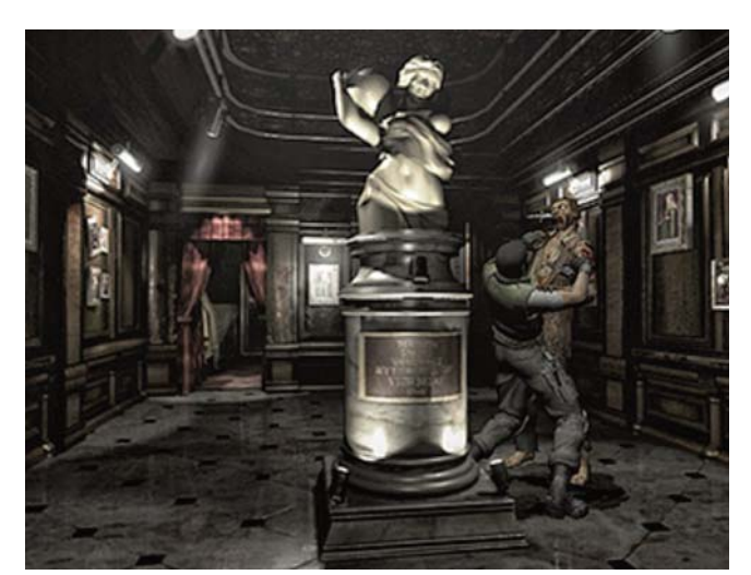
Figure 2. Resident Evil (Capcom, 2002)

One example, for instance, would be the survival horror adventure Resident Evil (Capcom, 2002). While it is fair to say that this game has plenty of audio-visual resources that help to create a gloomy environment, some ludic elements help to do this as well. For instance, the limited possibilities of movement combined with a fixed-camera system make the player quite vulnerable to any threat.