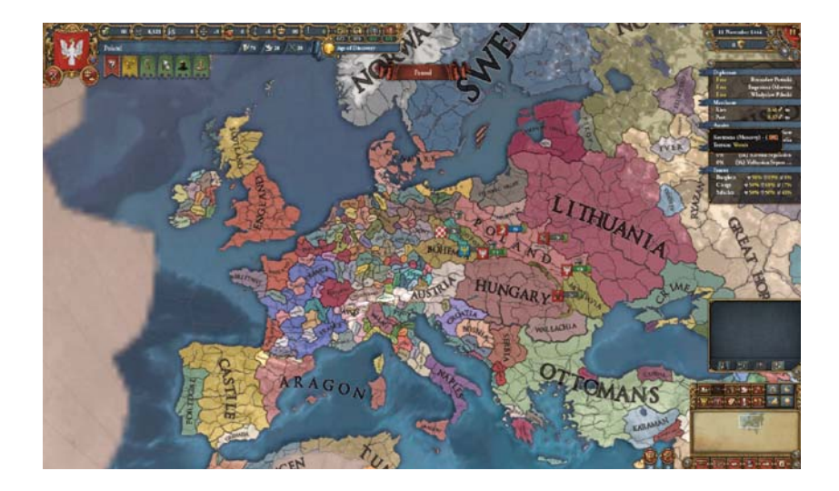
Figure 3. 1444 map in Europa Universalis IV

As the game progresses, players and Al-controlled countries interact in order to fulfill the historical goal of those countries during the Early Modern period: to maintain their dominions and defend from both foreign and domestic aggressions (Maquiavelo, 2016). Diplomacy, trade, public spending, the army, the navy, and so on are just the tip of quite a deep ludic iceberg. The game evolves slowly and ends in 1821. During this evolution, some rules are history-driven. For instance, there is a value in the game called "reform desire". This will increase as Catholic countries abuse some ecclesiastical prerogatives. When it reaches 100 points, an algorithm will be triggered and – in most scenarios – a German-speaking province will be the center of the Reformation, where a monk will write his 95 theses. Another history-driven element is the mission system. Each country will have a mission tree. Completing these missions will give that country some improvements and bonifications. For instance, if Poland is selected, the player will gain certain advantages if Mazovia is reincorporated into the Kingdom of Poland, and even greater ones if the Polish-Lithuanian Commonwealth is eventually formed.